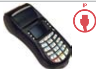
Optimum T4220 (P/N# 010332-xxx)