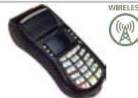
Optimum T4230 (P/N# 010332-xxx)