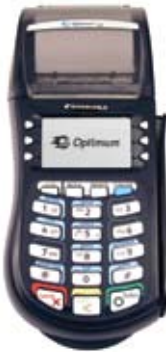
Optimum T4200 Family