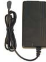
A/C Power Adapter