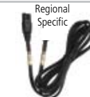
Power Cord (P/N# Based on Region)