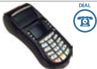
Optimum T4210 (P/N# 010332-xxx)